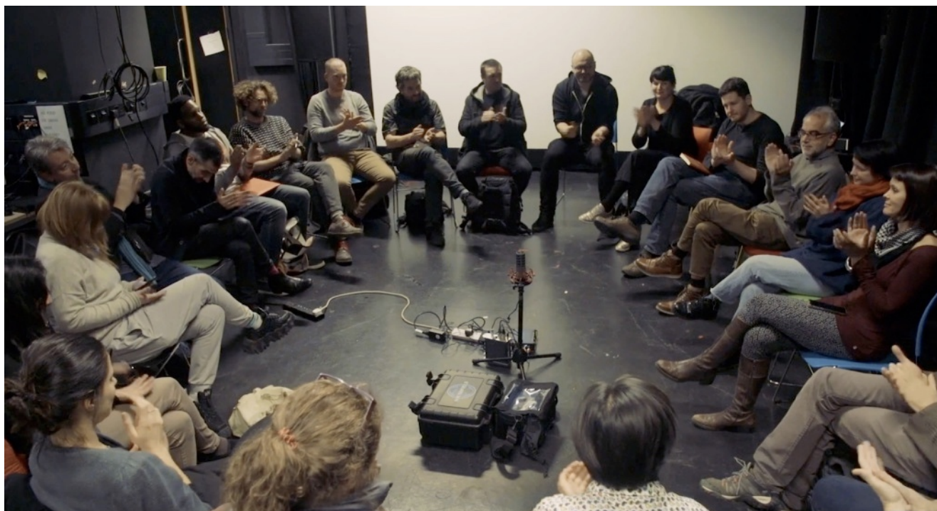
Soundstack 2019 Workshop

Book your place (https://www.eventbrite.co.uk/e/intersections-2021-soundstack-spatial-sound-through-the-browser-tickets-142392376431)