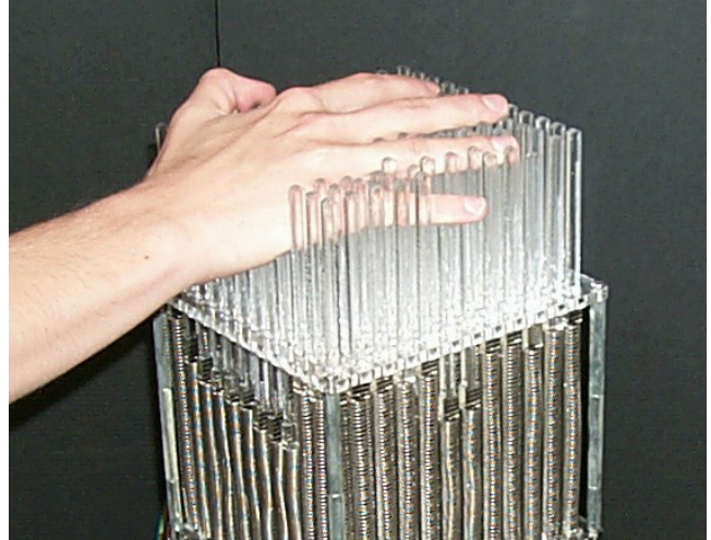
Figure 1 User interacting with the MATRIX interface.

The MATRIX is a tactile interface that controls a multi-modal musical instrument. It functions as a versatile controller that can be adapted to new tasks and to the preferences of individual performers in a variety of different environments. The interface provides musicians with a sculptable 3-D surface to control sound and music through a bed of push rods (see figure 1). Based on a user's real-time input, musical mapping algorithms control different types of signal processing algorithms.